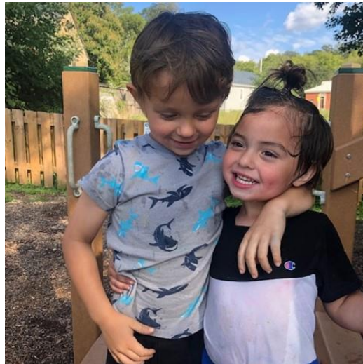
Two of Windy Hill's little ones who, thanks to the Nest to Wings program, are loving preschool at Grace Montessori!

From Nest to Wings through Post-Secondary Education, Our Donors Make Dreams Happen!